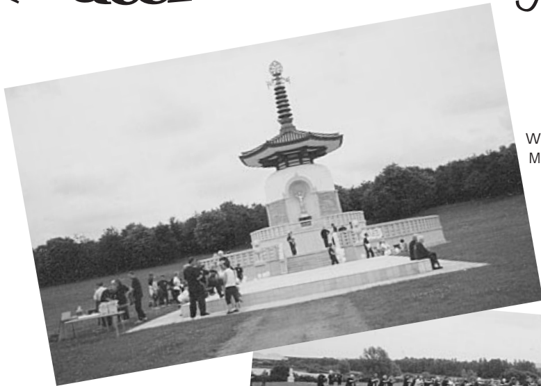
Willen Peace Pagoda, Milton Keynes